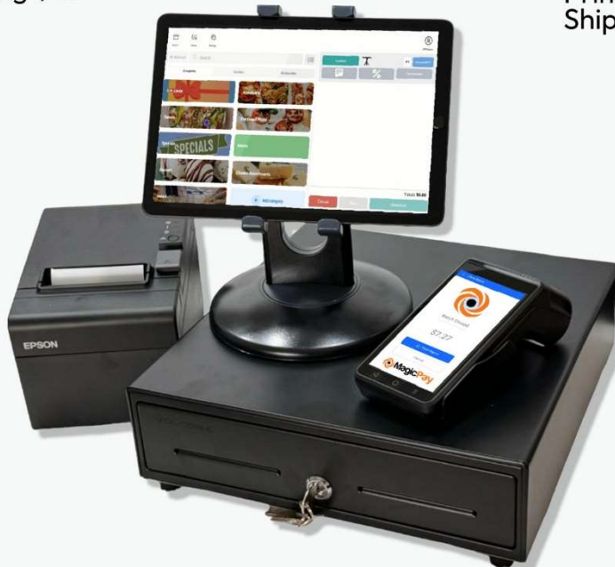
Table Pro Bundle Barcode Scanner (Wireless) Shipping $88